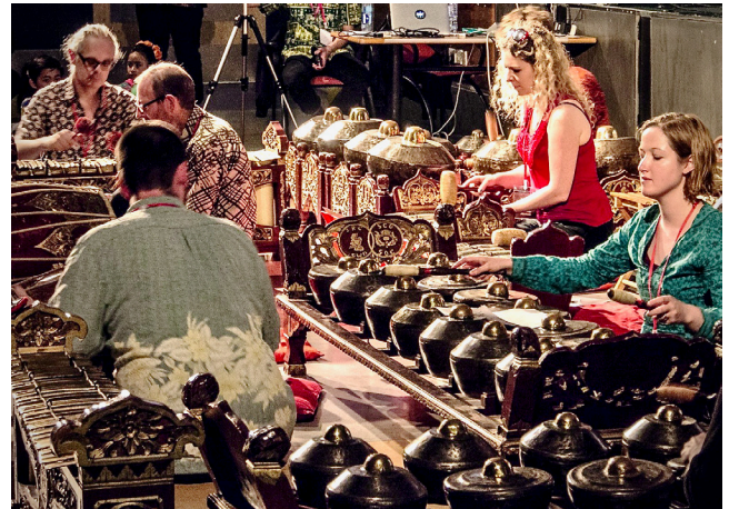
Gamelan Naga Mas playing the Spirit of Hope instruments.

It was a bit hit-or-miss initially as we navigated through the unfamiliarity of the coding language and idiosyncrasies of Estuary itself. Despite working with digital samples, we still needed to "damp" the sound in order to stop distortion caused by the ringing. Simon then trimmed the samples, which effectively allowed us to automatically damp the instruments.